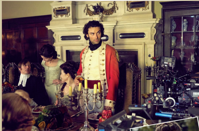
Above: Aiden Turner as Ross Poldark Right: Heida Reed as Elizabeth

Chavenage has often been used for a location for TV and film productions. Credits include: Barry Lyndon , the Hercule Poirot story The Mysterious Affair at Styles , The House of Elliot , Casualty , Cider with Rosie , Dracula , Lark Rise to Candleford , Bonekickers and Tess of the D'Urbervilles starring Gemma Arterton and Oscar winning Eddie Redmayne. Recently Channel 4's historical drama New Worlds starring Jamie Dornan, and scenes from the BBC's Wolf Hall , were filmed at Chavenage which also features as Trenwith House in Poldark .